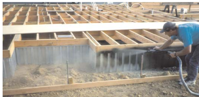
Panels are field-coated or pre-coated from the factory.

ANCHORPANEL saves most of the labor cost of a perimeter foundation. It also allows framing the floor first , which is faster, easier, and allows underfloor utility work to proceed concurrently with the foundation. Our panels meet FHA foundation requirements. Labor savings and time savings both exceed 50%.