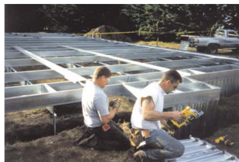
Metal floors are of course 100% compatible.