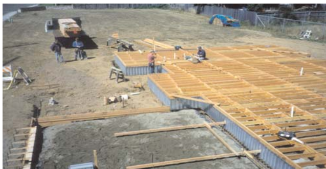
Hang ANCHORPANEL from perimeter, so that panel bottoms are at the middle of a footing trench. Place concrete in the trench.