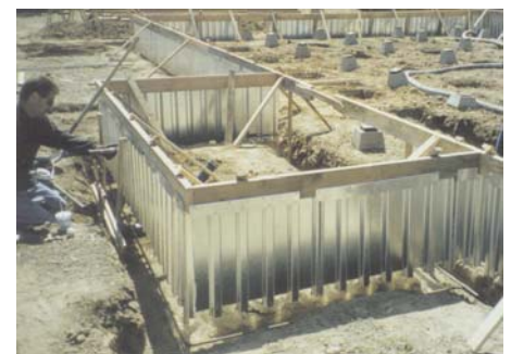
Panels can hang from staked guides.

Manufactured? Panelized? New Construction? Retrofit? Sloping sites? Backfill? Two-story strength? High sets? Low sets?