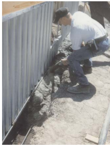
Two-story concrete going in.