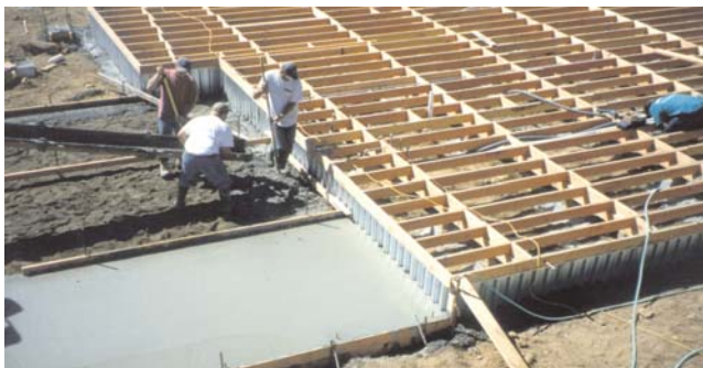
Slabs can go against panels during the panel footing pour!