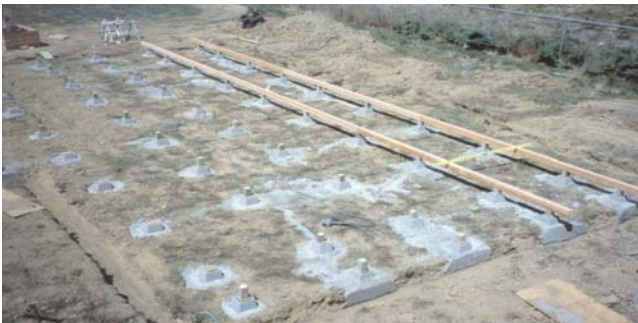
After site prep, pour interior pads to start the floor framing.

Inexpensive cast-in-place panels provide superior seismic strength and wind strength while saving time and money.