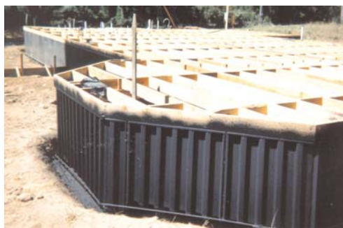
Panels follow complex footprints easily.