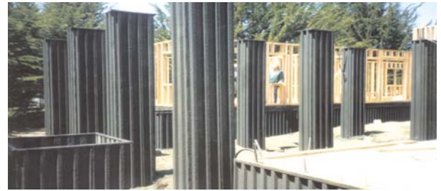
Architects can go wild with color-textured panels.