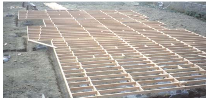
Frame out entire floor (before building the perimeter foundation).