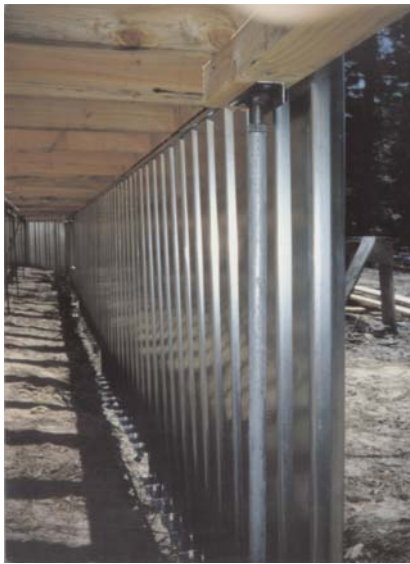
Tall panels from the interior.