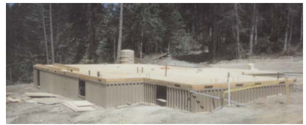
Custom home in the woods. Sloping sites are easy.